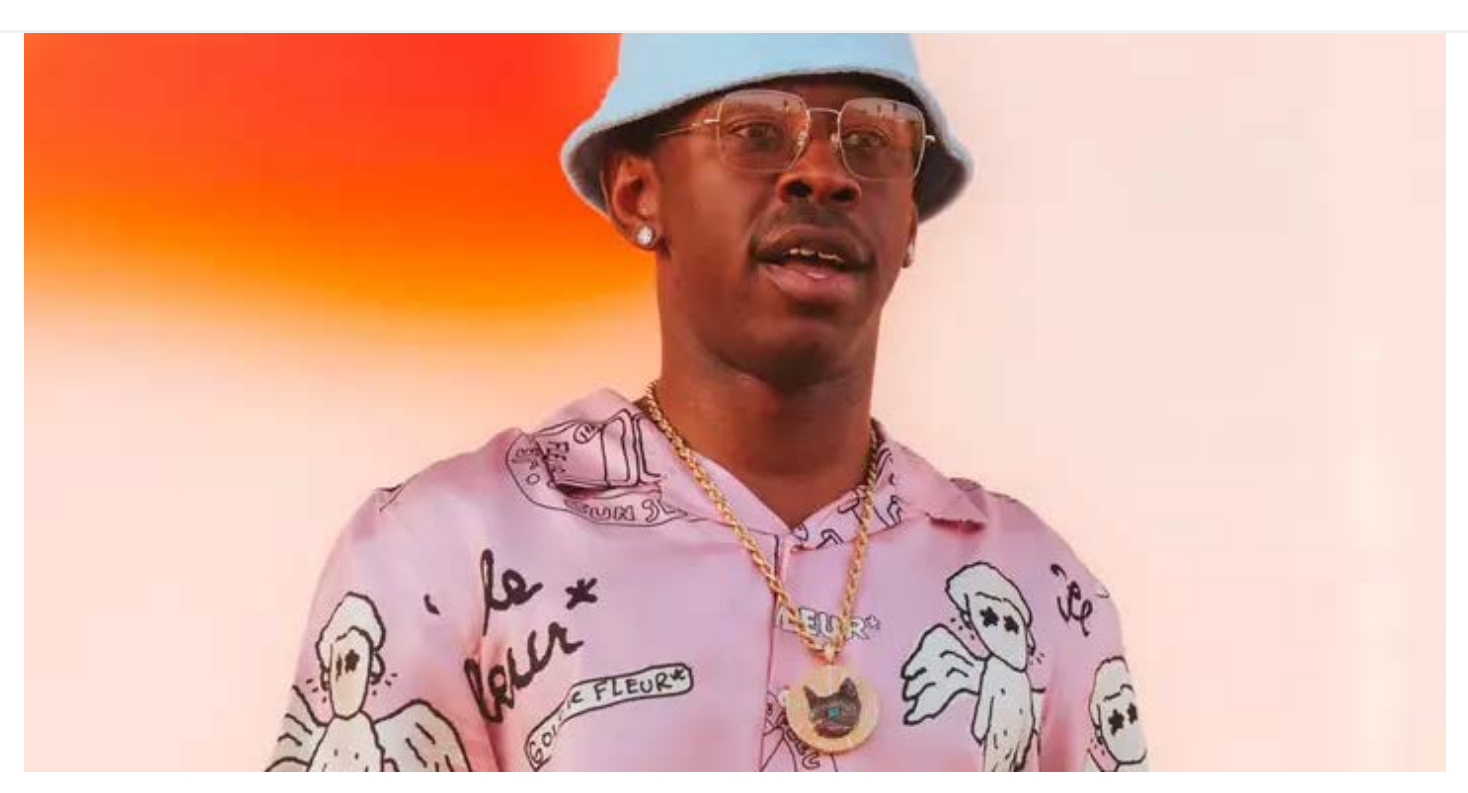
Desert Runway: The Best Celebrity 'Fits of Coachella 2023