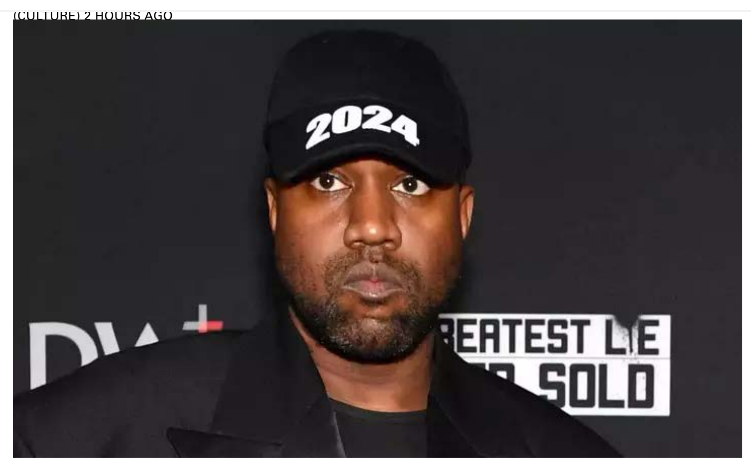
Kanye's 2024 Presidential Campaign Was Doomed From the Start