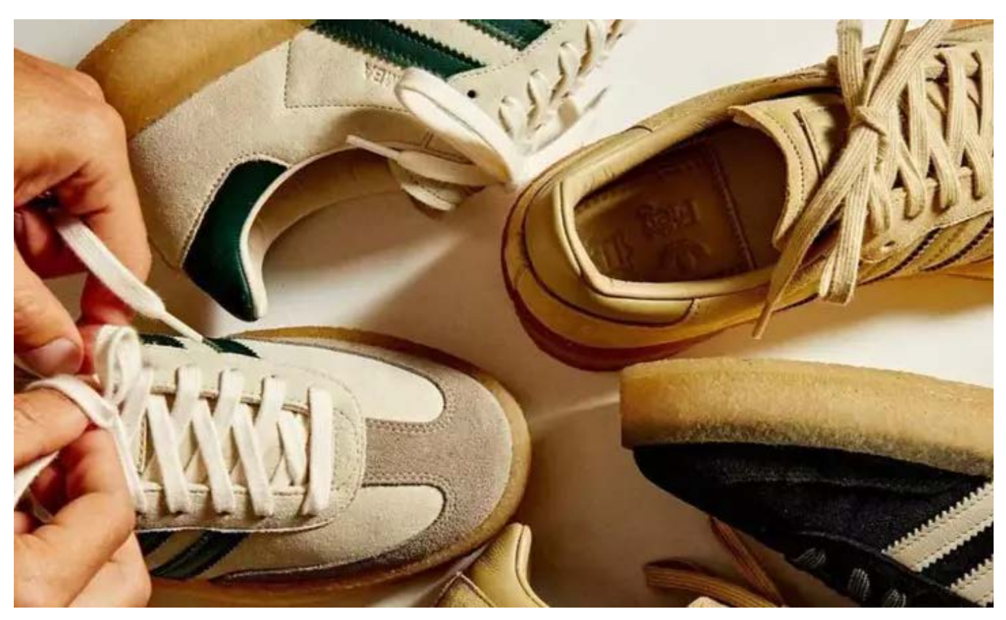
KITH & adidas Drop More Special, Summer-y Sambas