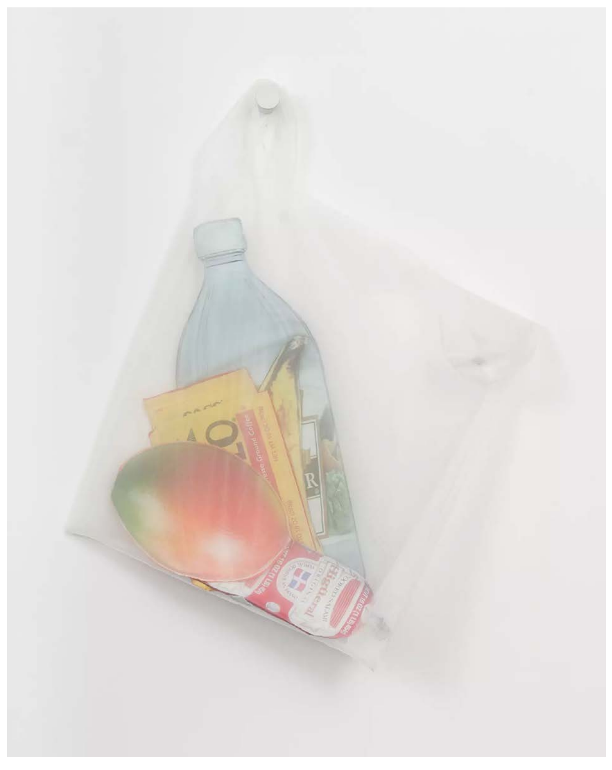
Lucia Hierro, Mandaito: Vinagre, Bustelo, 1 Mango, 1 Platano Maduro, Salami Higueral, 2021