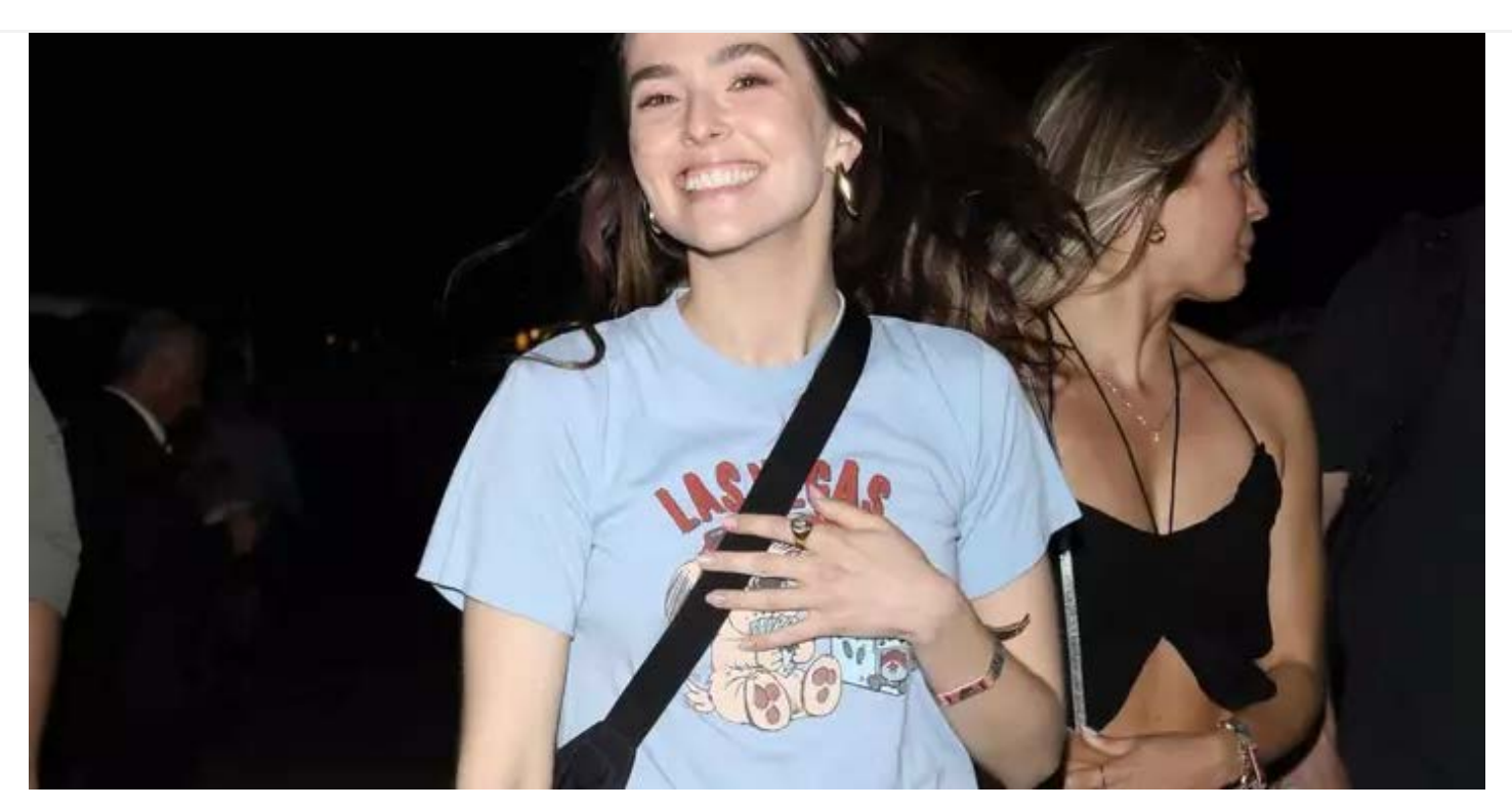
The Influencer Masterclass on How Not to Dress For Coachella