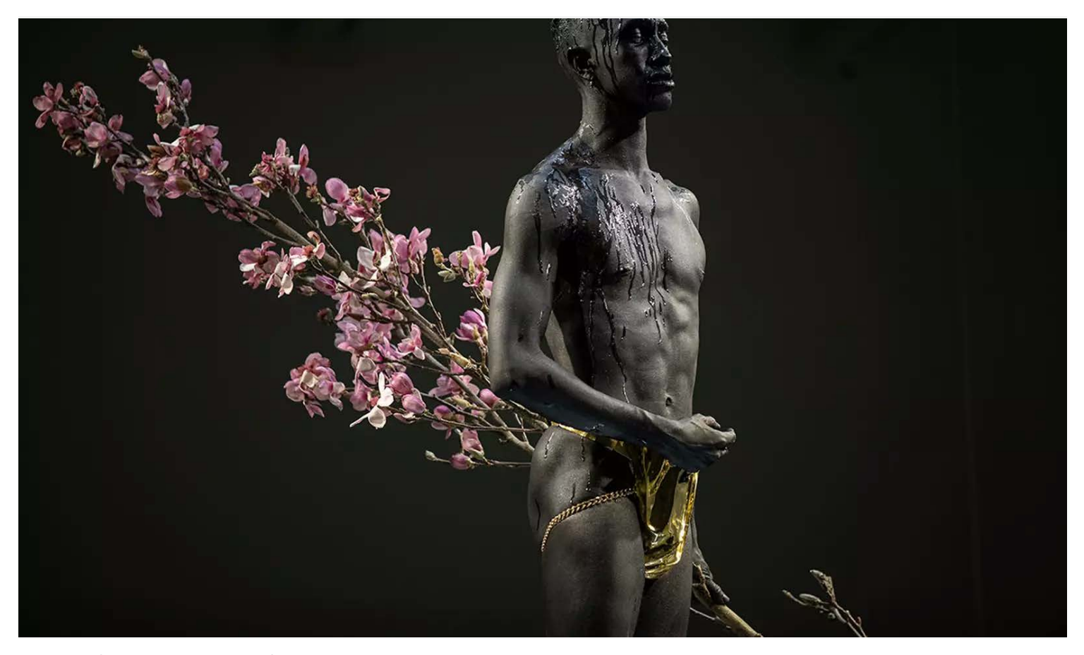
Miles Greenberg, PNEUMOTHERAPY II, 2020