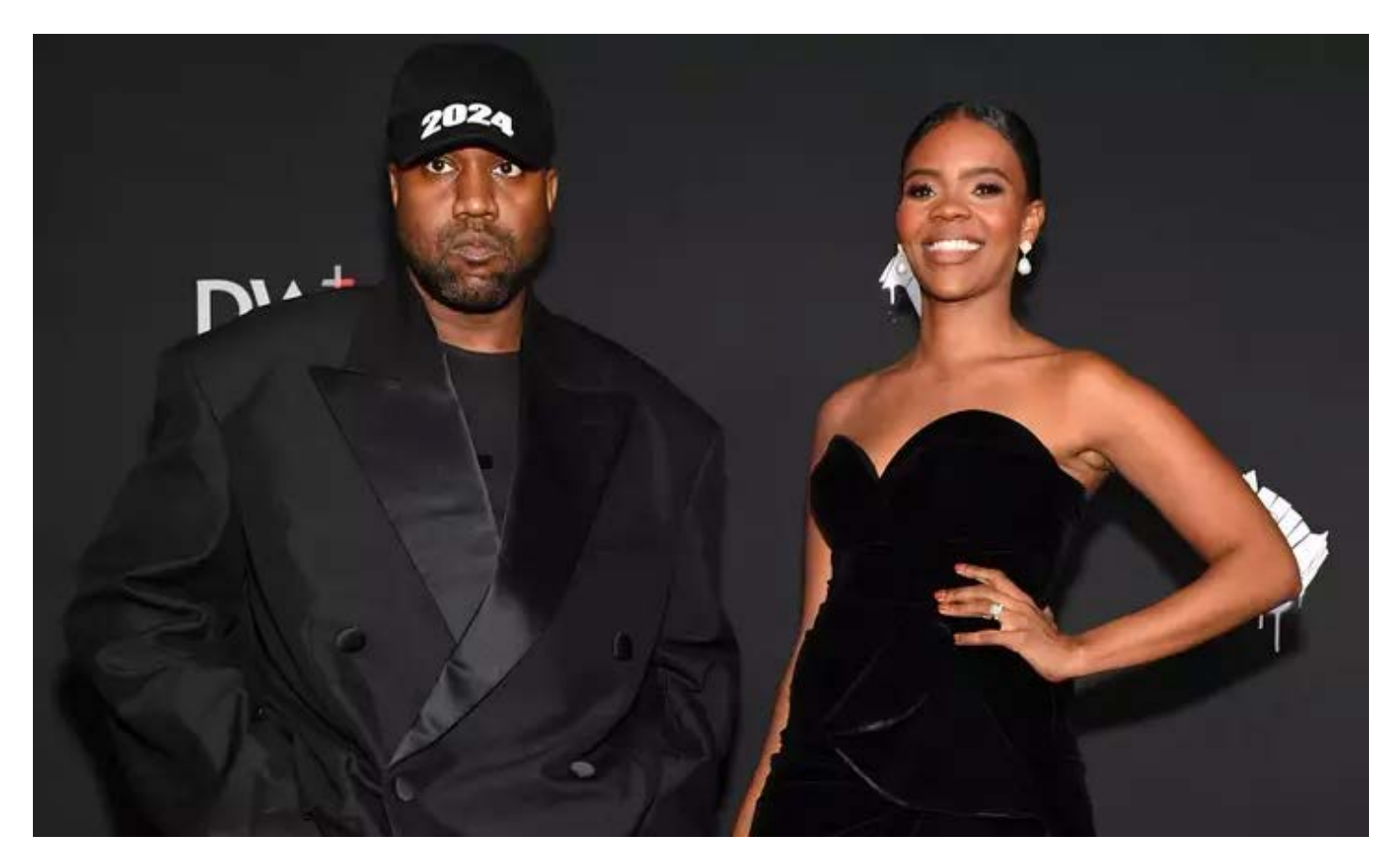
Kanye's Anti-Semitism Shouldn't Be Surprising