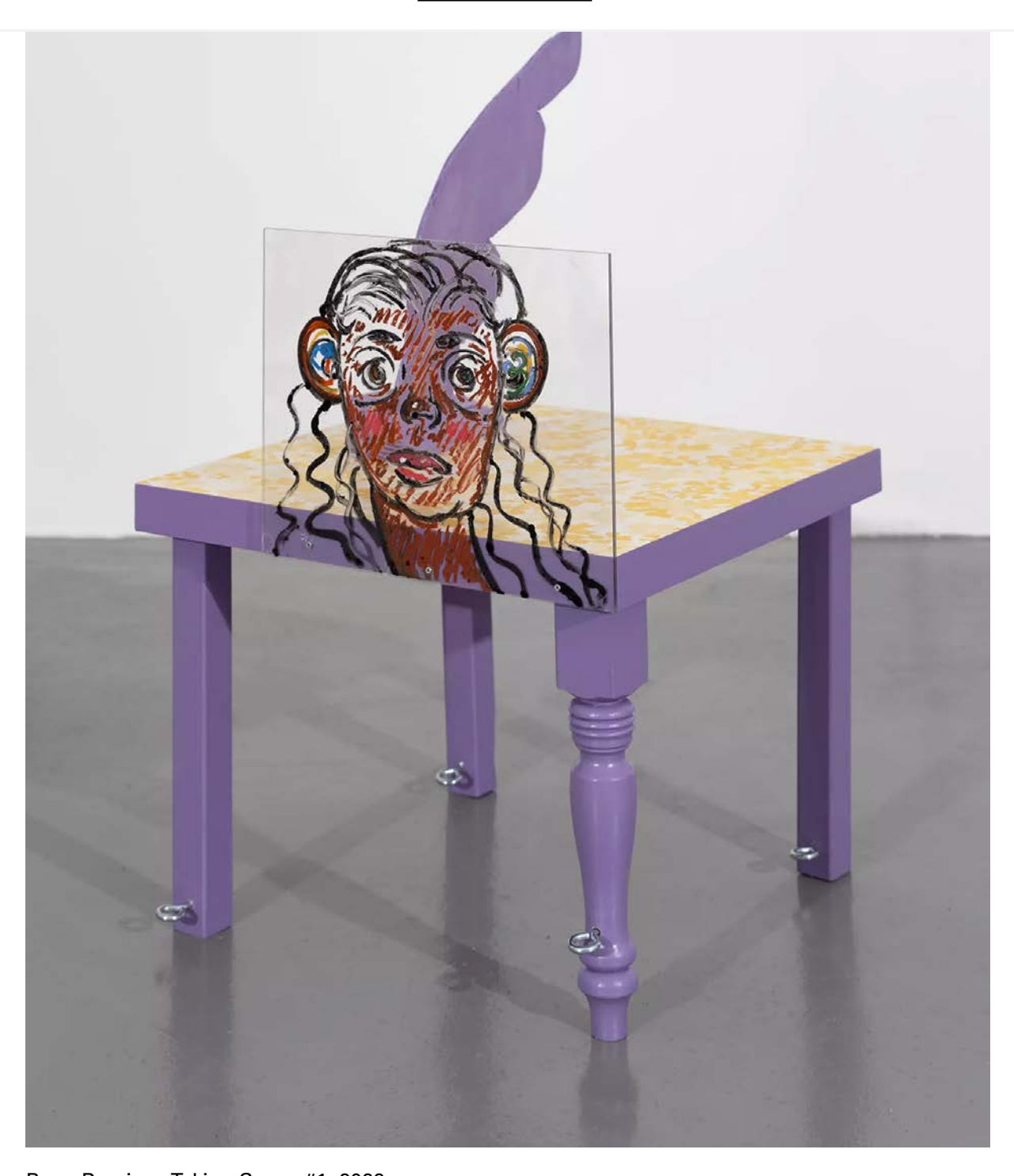
Bony Ramirez, Taking Space #1, 2022